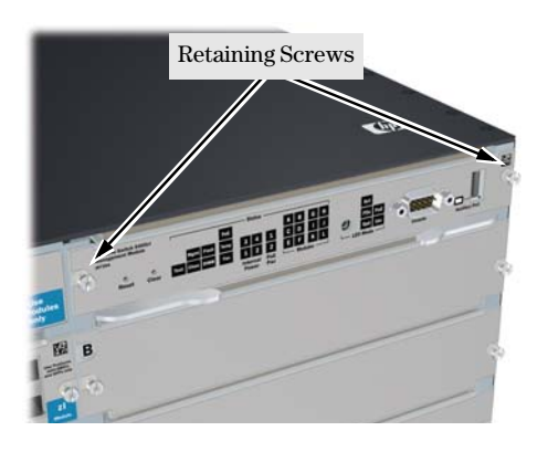
Figure 1. 5406zl Management Module

ProCurve Switch 5400zl or 8200zl Series.