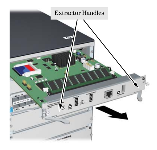
Figure 3. 8212zl Management Module